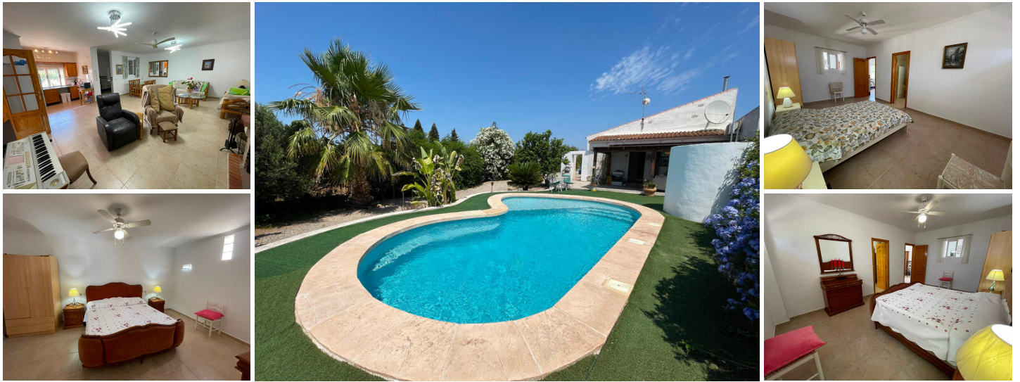
Charming Single-Storey Villa with Private Pool and Large Plot in Daya Nueva

Discover this beautiful property located in the peaceful and picturesque village of Daya Nueva, in the heart of the Costa Blanca. The area is known for its natural surroundings, relaxed atmosphere, and proximity to local amenities and beaches.