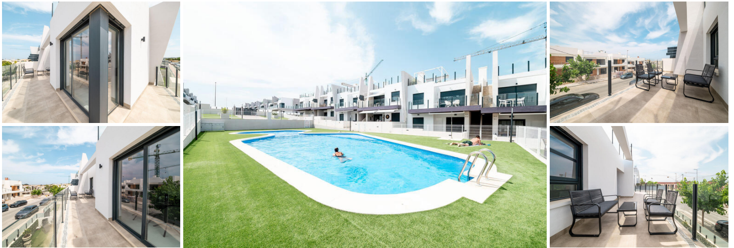
Bright and Spacious 3-Bedroom Duplex Penthouse in San Miguel de Salinas!

Looking for a spacious and sunny penthouse in a peaceful yet well-connected location on the Costa Blanca? Discover this stunning 3-bedroom duplex penthouse in the charming town of San Miguel de Salinas, located in the popular area of Blue Lagoon / Mirador de San Miguel.