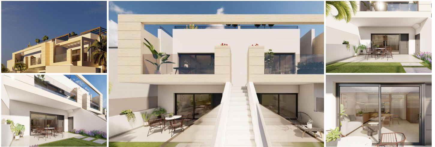
New Build Bungalows in San Pedro del Pinatar Modern Living Near the Beach