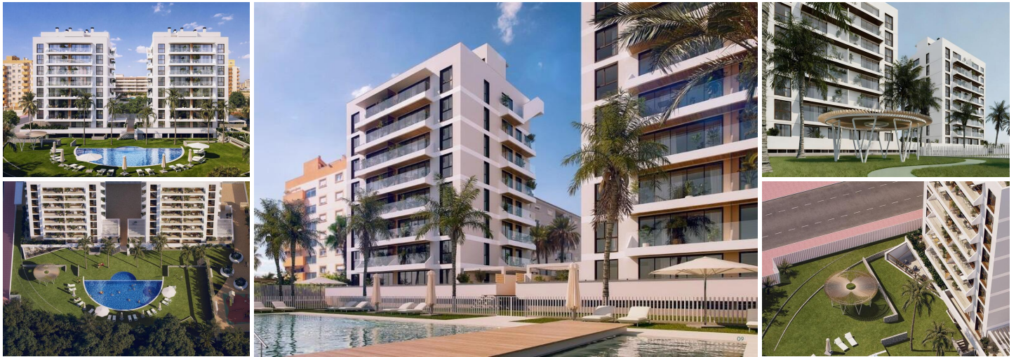
Modern New Build Apartments Near the Beach and Marina in Guardamar del Segura