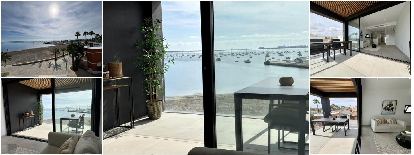
Exclusive Beachfront Duplex Penthouse with Panoramic Sea Views and Private Southwest-Facing Roof Terrace

Experience this elegant duplex penthouse on the first beach line in Lo Pagán, San Pedro del Pinatar – a home that perfectly combines modern architecture, high comfort, and a spectacular view of the Mediterranean Sea.