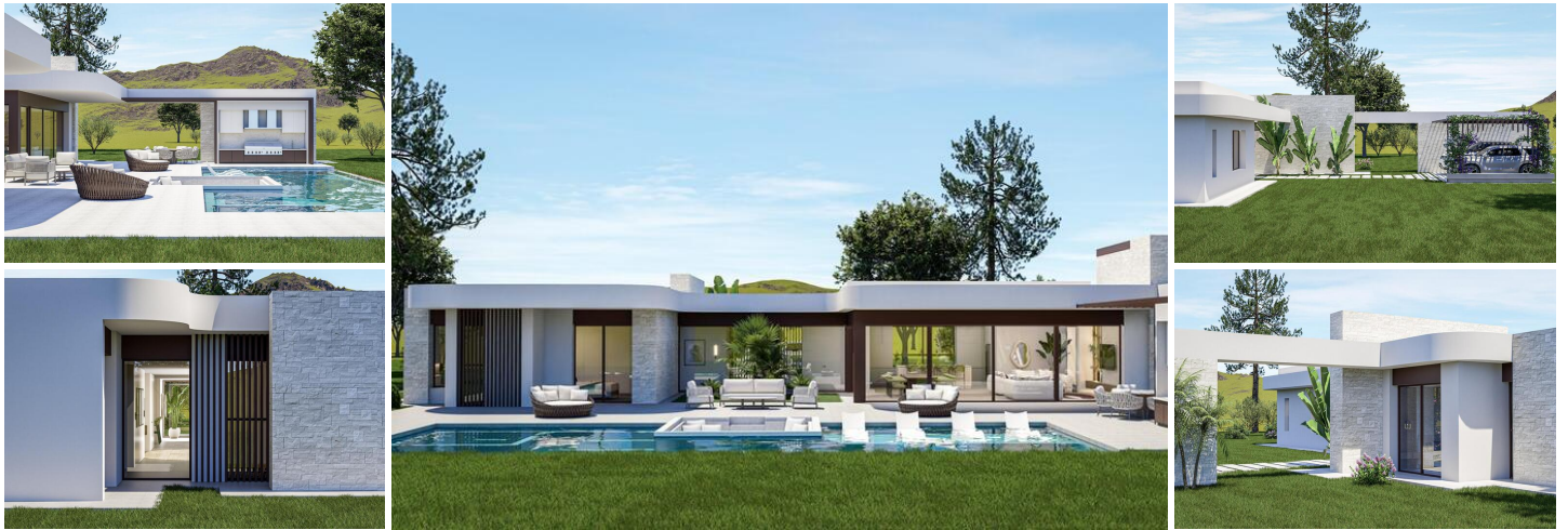
Custom Built New Villas in Pinoso (Alicante): Spacious Homes in Natural Surroundings