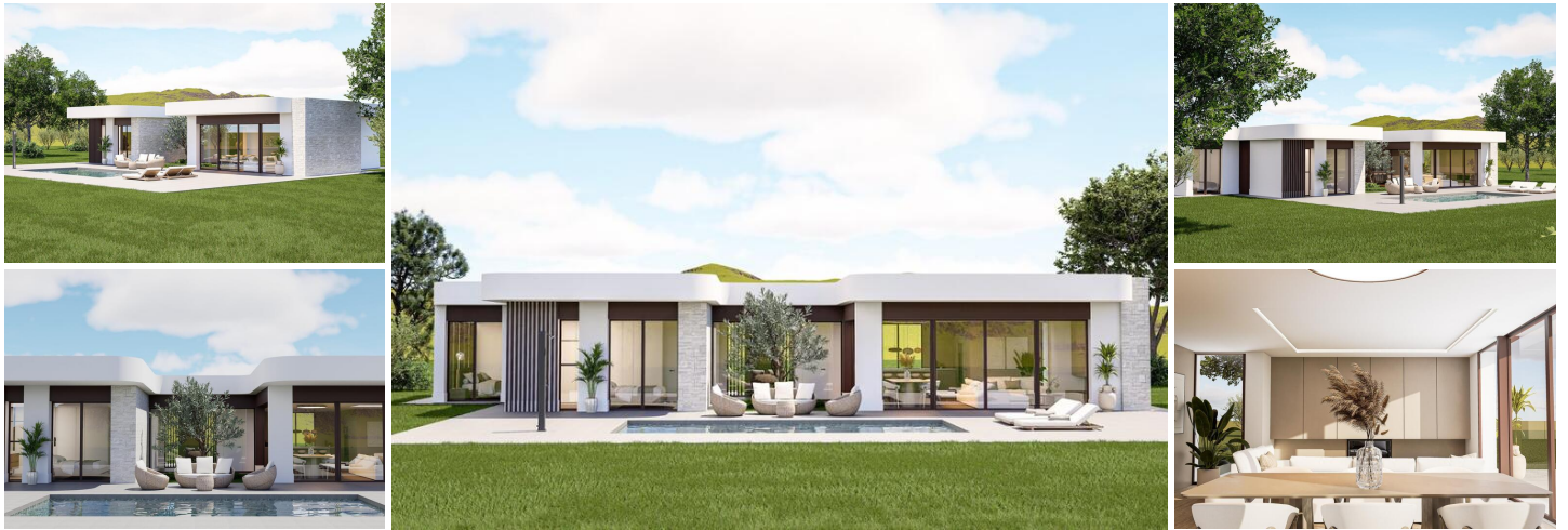
Custom Built New Villas in Pinoso (Alicante): Spacious Homes in Natural Surroundings