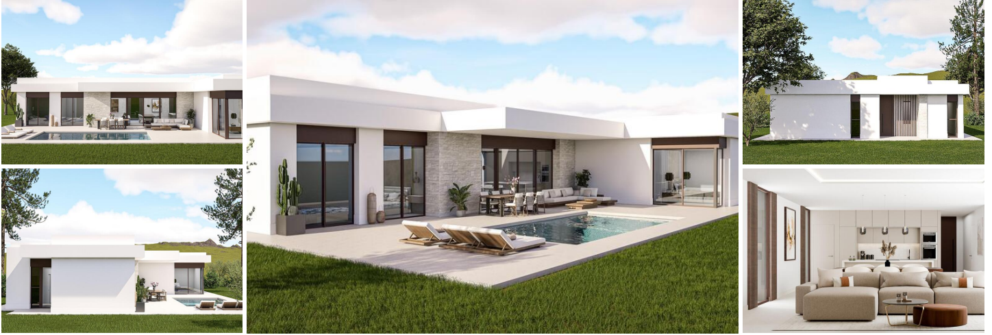
Custom Built New Villas in Pinoso (Alicante): Spacious Homes in Natural Surroundings