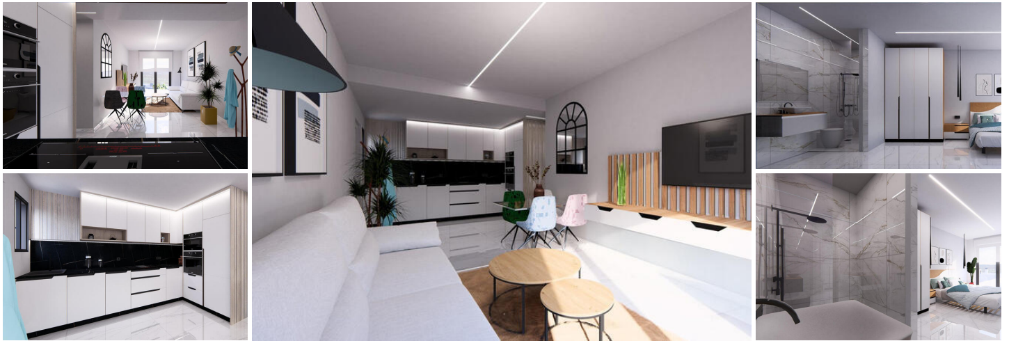
Modern 2-bedroom bungalow with pool and parking in Algorfa

This single-storey bungalow is part of a private residential development that combines comfort, functionality and natural surroundings. The property has been designed to offer a practical and balanced layout, with well-connected spaces filled with light.