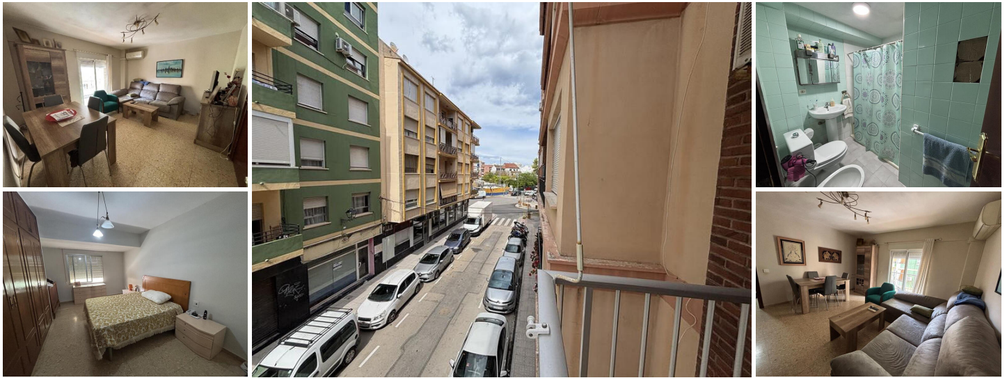
Spacious Apartment in the Center of Dénia – Ideal for Renovation and Investment

If you're looking for space, location, and potential, this apartment is for you.