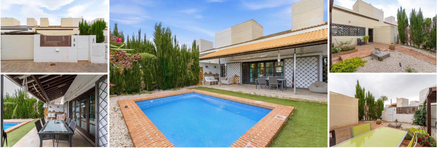
Stylish townhouse with private pool Stylish townhouse with private pool in sought after La Peraleja Golf, Sucina

Welcome to this charming and well-planned 2 bedroom, 2 bathroom home, located in the exclusive area of La Peraleja Golf in Sucina. The house is situated on a sunny south-facing plot of 270 sqm and offers a private pool area - perfect for relaxing and enjoying lovely days in the sun.