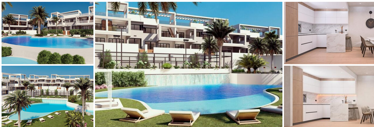
NEW BUILD RESIDENTIAL OF BUNGALOW APARTMENTS IN LOS BALCONES

New Build UNIQUE residential complex in Los Balcones.