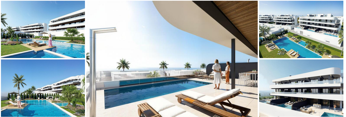
New Build Golf Front Apartments and Villas in La Serena Golf Los Alcazares