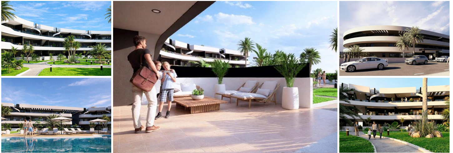
Luxury Golf Front Apartments Near the Sea in Los Alcazares Costa Calida