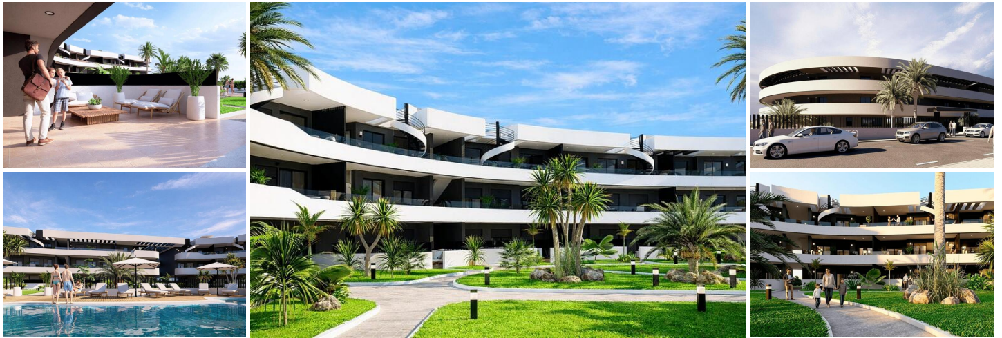
Luxury Golf Front Apartments Near the Sea in Los Alcazares Costa Calida