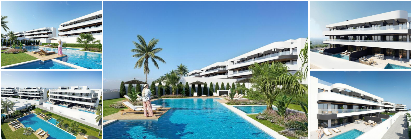
New Build Golf Front Apartments and Villas in La Serena Golf Los Alcazares