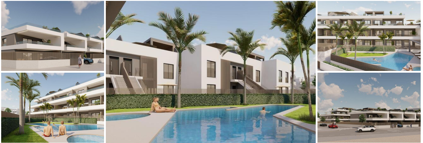
New Build Apartments and Bungalows for Sale in Pilar de la Horadada Near the Beach