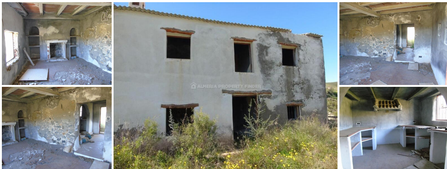
Cortijo Calli - A country house in the Cantoria area. (For Renovation)

A detached 3/4 bedroom country house for sale in the province of Almeria, a 3 minute walk to the local bar or a 30 minute stroll and within a 14 minute drive of the pretty village of Arboleas which has all the amenities you require for day to day living including a supermarket, general store, brand new medical centre, chemist including a supermarket, general store, brand new medical centre, chemist, post office, banks, a gym, pavement tapas bars and a weekly street market on Saturdays. The larger town of Albox with many more facilities is about a 30 minute drive away. The golden Mediterranean beaches of Vera Playa, Mojacar, Garrucha can be reached in 35 minutes and there are three airports within easy commute via excellent motorway connections, Almeria, Murcia and Alicante.