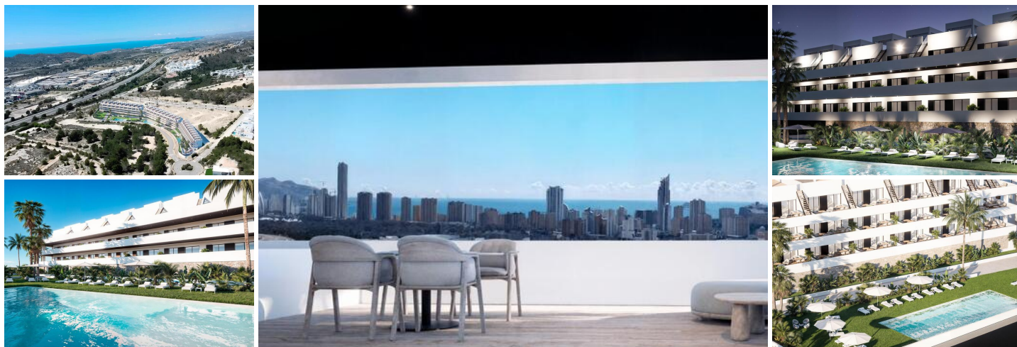
Exclusive New Build Residences with Sea Views in Finestrat, Alicante

Prime Location with Panoramic Views of Benidorm and the Mediterranean