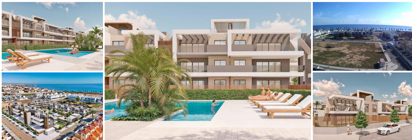
Luxury Tourist Apartments Just 150m from Las Higuericas Beach – Torre de la Horadada