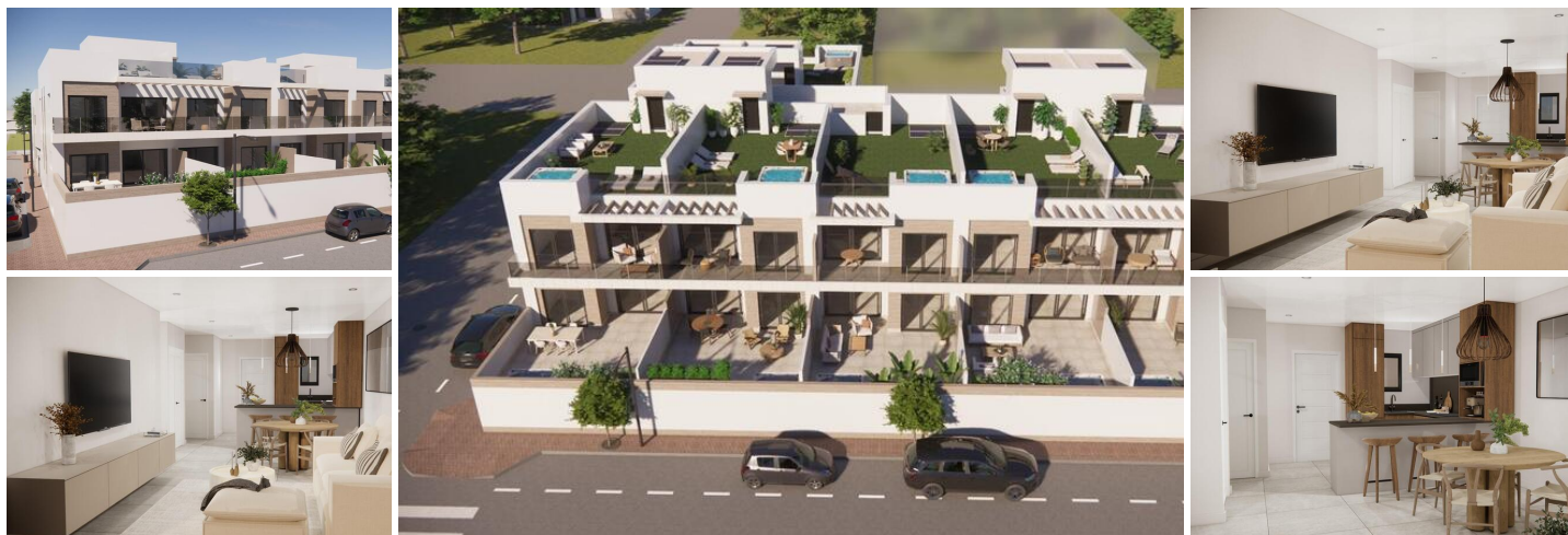
New Build Apartments in Rojales Close to Golf and Beaches