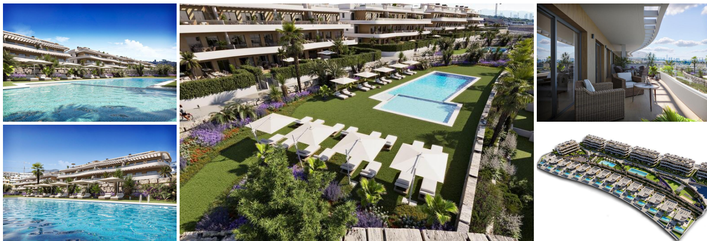
Luxury New Build Apartments and Villas with Panoramic Sea Views in Finestrat