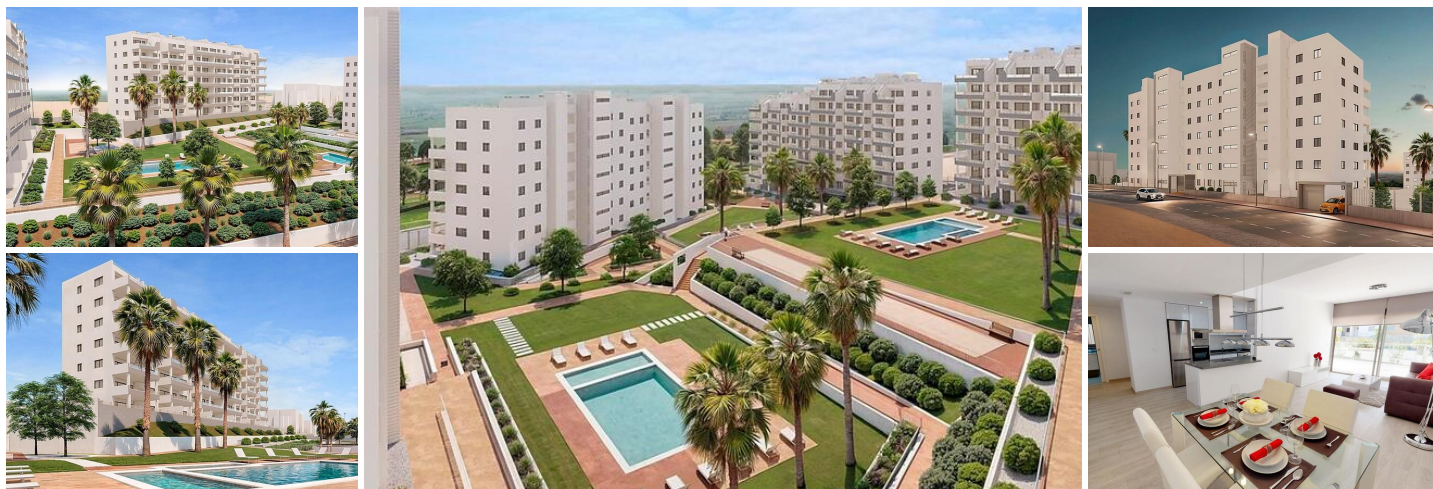
New Residential Development in San Miguel de Salinas