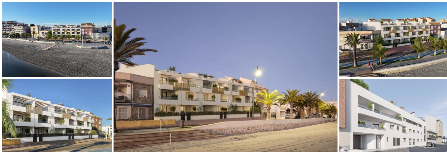
NEW BUILD FRONTLINE RESIDENTIAL IN SAN PEDRO DEL PINATAR

Nestled along the captivating Mar Menor, Lo Pagan is a town in Murcia that unveils a seamless blend of natural beauty and cultural richness, offering a perfect escape for those seeking a tranquil oasis. Conveniently accessible, with just a 57-minute ride from Alicante Airport, Lo Pagan beckons you to unwind, explore, and create cherished memories in this idyllic Spanish coastal town.