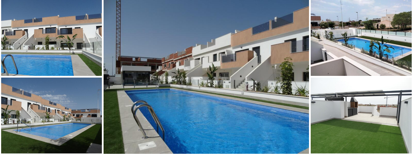
Newly Built Bungalows with Solarium or Garden in Pilar de la Horadada