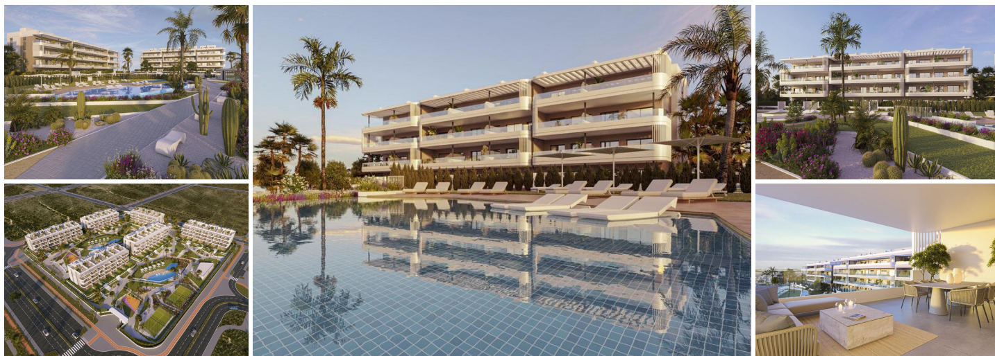
Modern New Build Apartments in La Hoya, Torrevieja