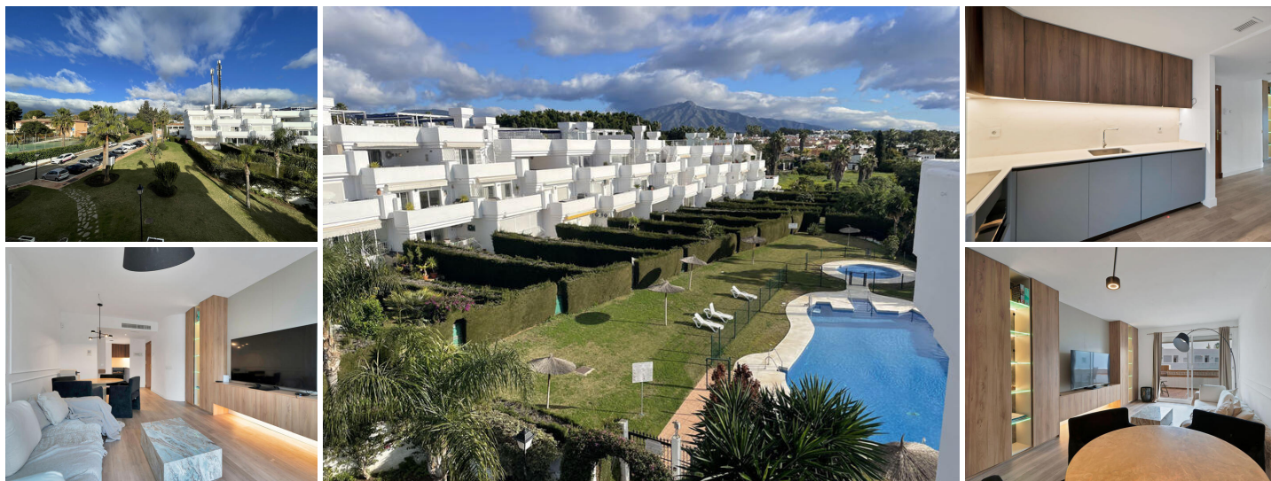
Fantastic Remodelled Duplex Penthouse – Walking Distance to All Amenities

This beautifully remodelled duplex penthouse is ideally located within walking distance to schools, tennis, golf, beaches, shops and restaurants, offering a superb lifestyle with no need for a car.