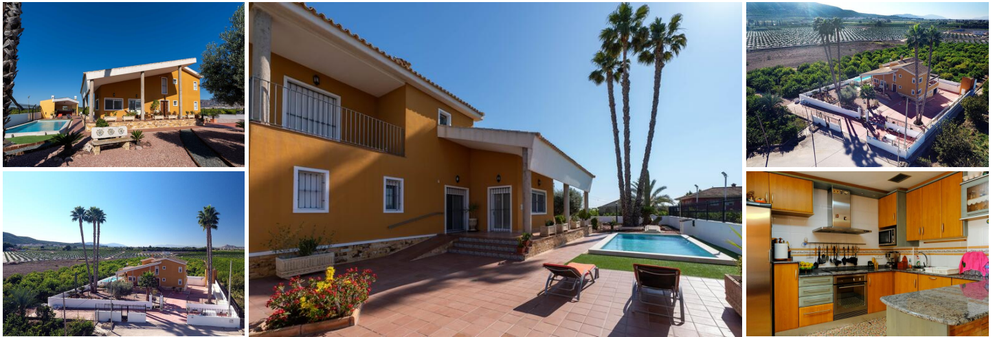
AMAZING COUNTRYSIDE FINCA WITH INCOME

9,480 m2. fully fenced property with 495 m2. house built on a plot of 1,000 m2. all fenced within the perimeter of the property.