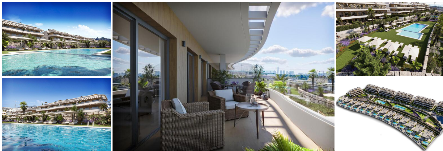
Luxury New Build Apartments and Villas with Panoramic Sea Views in Finestrat