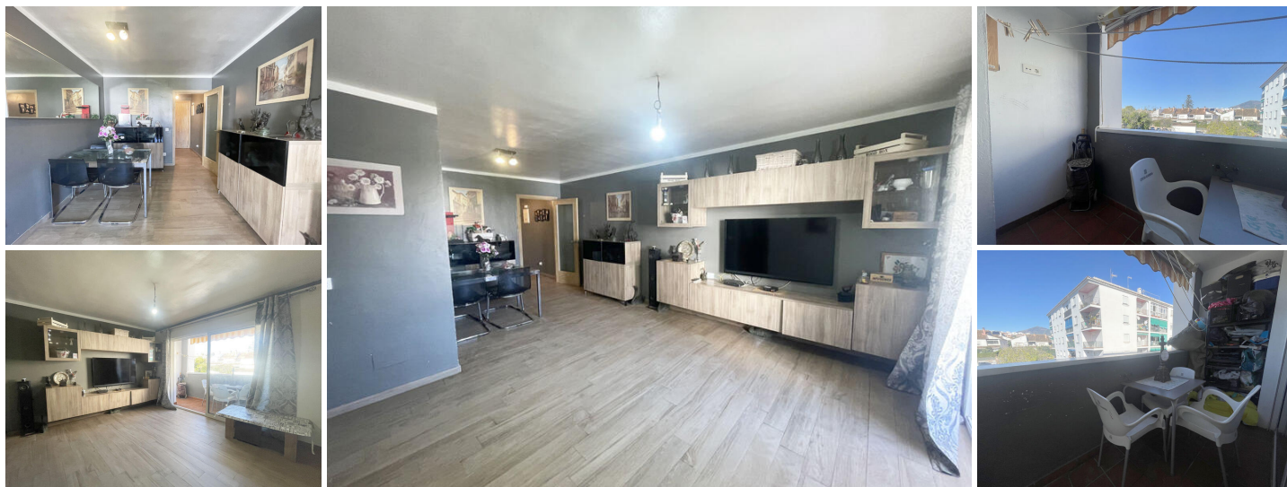
3-Bedroom Apartment – San Pedro Centre

In the heart of San Pedro de Alcántara, close to all services and shops, discover this spacious 3-bedroom apartment.