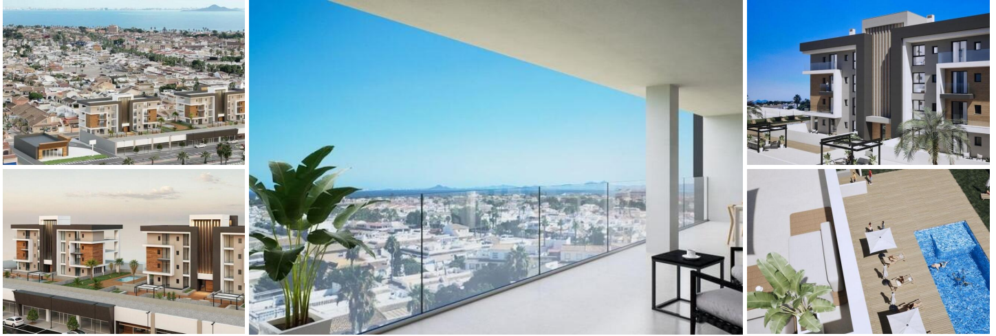
Tourist Apartments with Rental License in Los Narejos, Los Alcázares