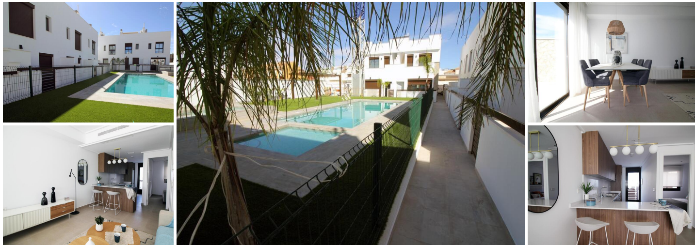
Modern Townhouses and Semi-Detached Homes in Pilar de la Horadada

Discover this exclusive residential development featuring only six modern semi-detached and terraced homes in the tranquil town of Pilar de la Horadada, on the southern tip of the Costa Blanca. Designed with contemporary architecture and high-quality finishes, these new-build properties offer a perfect blend of comfort and style in a sought-after location.