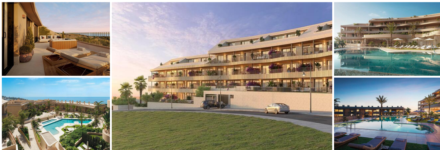
New Build Luxury Residences in El Higuerón, Costa del Sol