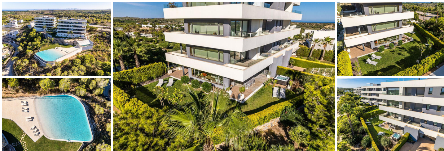
Extraordinary Ground Floor Apartment, Madroño Community, Las Colinas Golf & Country Club

Welcome to pure luxury living in one of the most exclusive communities of Las Colinas. This 2021 ground floor residence is unlike anything you have seen before, a home that blends the comfort of a villa with the ease of apartment living.