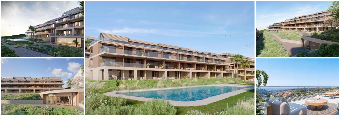
New Build Residential Complex with Golf and Sea Views near Estepona