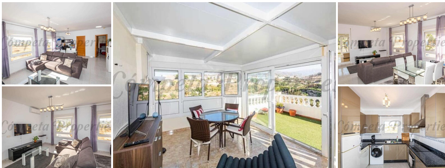
Beautiful 2-Bedroom Penthouse in Torrox Park.

Available from September for long-term rental all year, this fully furnished penthouse apartment offers the perfect blend of comfort and convenience in the sought-after area of Torrox Park.