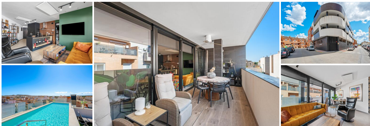
2-bedroom apartment with terrace in Edificio Valentina, Formentera del Segura

Located in the Edificio Valentina in Formentera del Segura (Alicante), this apartment stands out for its contemporary design, natural light, and quality finishes.