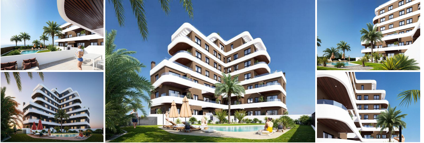
New Build Apartments in Guardamar del Segura – Modern Living Just 1.4 km from the Beach

Discover a new residential development in Guardamar del Segura, Alicante, offering just 19 exclusive, modern homes designed for comfortable, contemporary living on the Costa Blanca. Ideally located just 1.4 km from the beach and a short walk from the town center, this development combines style, practicality, and a prime coastal setting.