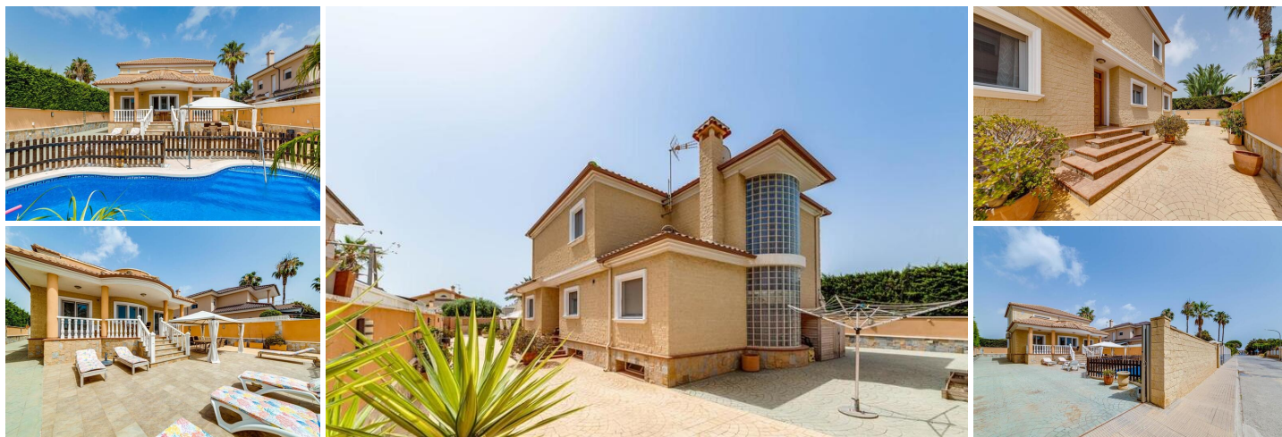
Elegant and Spacious Villa in the Exclusive San Javier Area

Let yourself be captivated by this villa that combines luxury, comfort, and an enviable location. Upon arrival, a beautifully tiled, low-maintenance garden with automatic entry welcomes you, leading to a private parking space. The outdoor area boasts a stunning saltwater pool with a jacuzzi and an outdoor shower, perfect for year-round enjoyment.