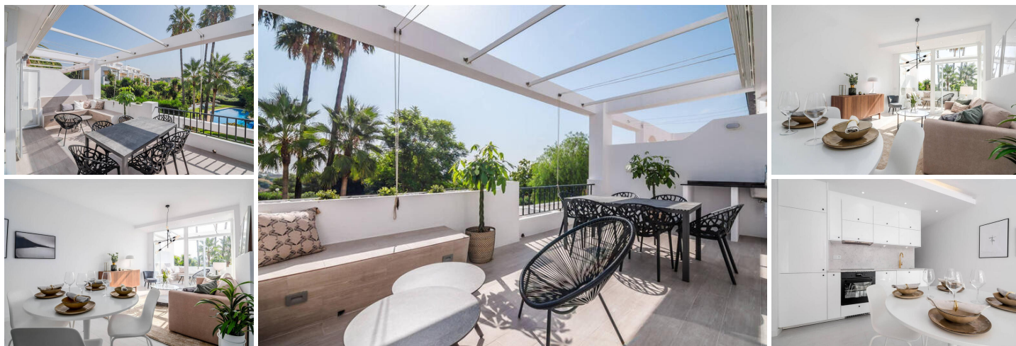
Elegant Ground-Floor Apartment with Golf & Sea Views – La Quinta, Benahavís

Discover refined living in this beautifully renovated, light-filled ground-floor apartment, perfectly situated in a prestigious development in La Quinta, Benahavís — one of the most sought-after areas on the Costa del Sol. Whether you're seeking a permanent residence, a holiday retreat, or a high-return investment, this stylish property ticks every box.