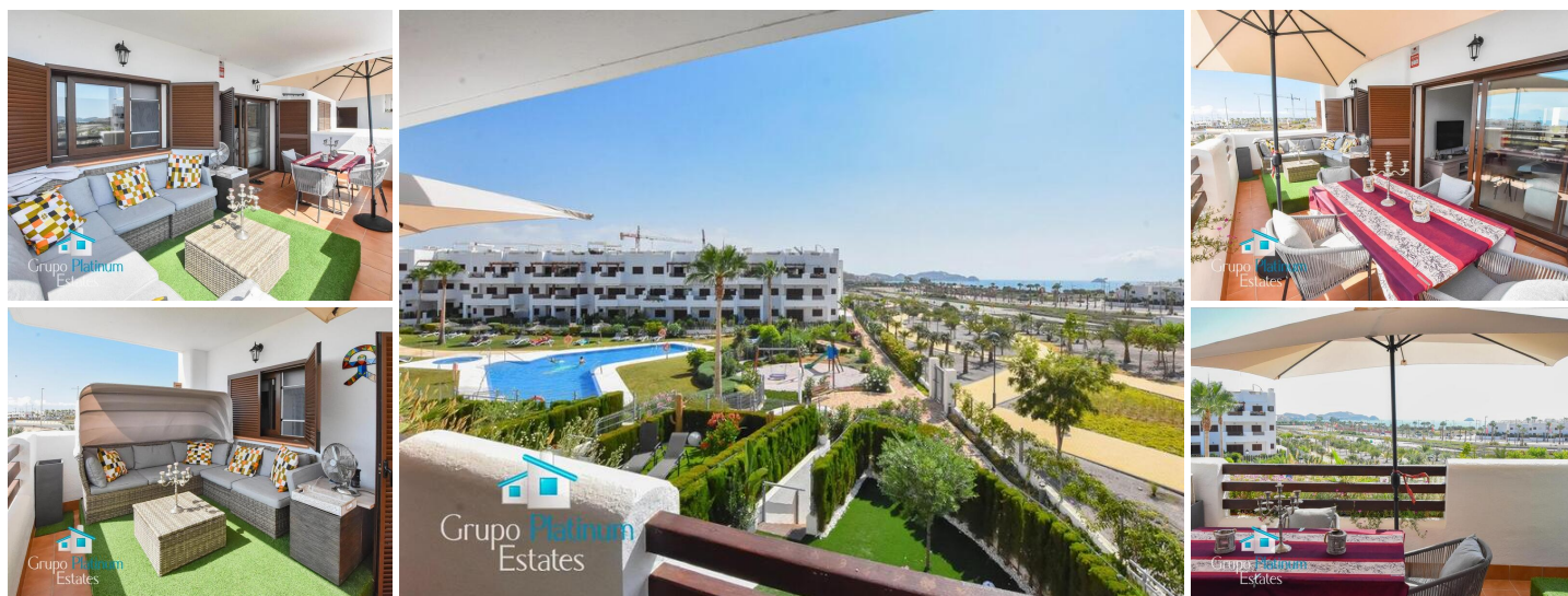
Stylish FirstFloor 3 Bedroom Apartment with Sea Views in Phase 7 of Mar de Pulpí

Experience Mediterranean living at its finest with this beautifully furnished and fully equipped first floor apartment, ideally located in the sought after Phase 7 of Mar de Pulpí, San Juan de los Terreros. Spanning 97 m 2 , this 3 bedroom, 2 bathroom residence offers the perfect blend of comfort, quality, and unbeatable sea views, all just a short stroll from the beach and local amenities. Step inside and be welcomed by a spacious, light filled living and dining area that opens directly onto a raised terrace. From here, you can take in sweeping views over the bay of San Juan de los Terreros a truly unique setting. The open plan kitchen is designed in a practical Lshape and has been thoughtfully upgraded with high spec appliances, an integrated wine bar, black marble finishes, and lacquered white furniture. A separate utility room houses the washing machine and provides additional storage.