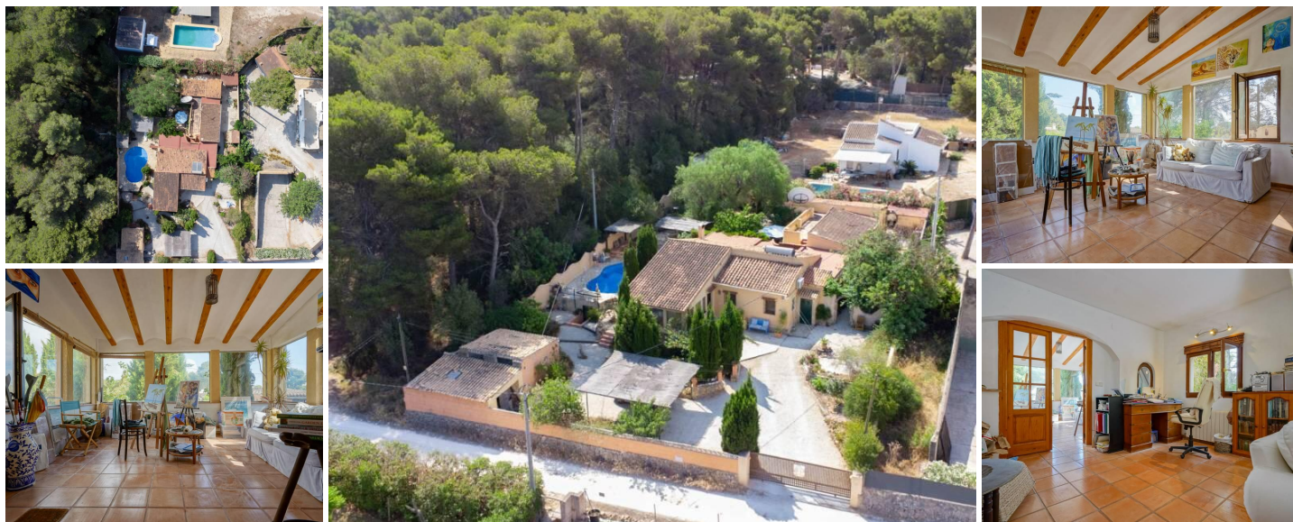
Traditional villa with Moroccan finishes located in the Montgó Natural Park.