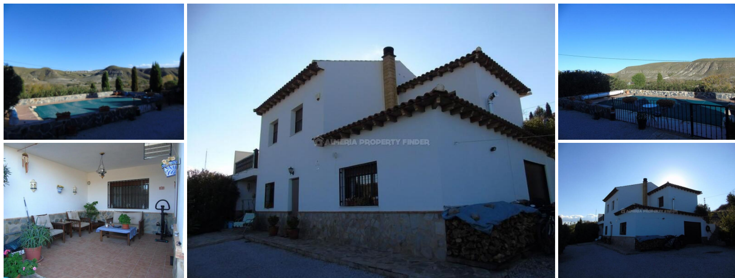
Cortijo Adella - A country house in the Caniles area. (Resale)