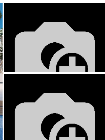
RIVIERA DEL SOL / MIJAS NEW Townhouse, Completion expected third quarter of 2025

A remarkable new off-plan development of contemporary semidetached houses in Riviera del Sol, Mijas, Expected date of completion end of 2024.