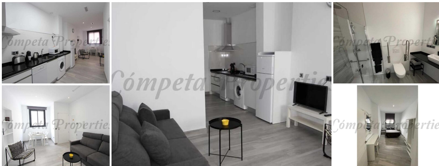
Stunning 1-Bedroom wheelchair-adapted apartment in Prime Nerja Location

Discover modern comfort and convenience in this newly built 1-bedroom, 1-bathroom apartment on Calle Granada, nestled in the heart of beautiful Nerja, Malaga. Just steps from the iconic Balcón de Europa and surrounded by a selection of picturesque beaches, this rental offers the perfect Mediterranean retreat.