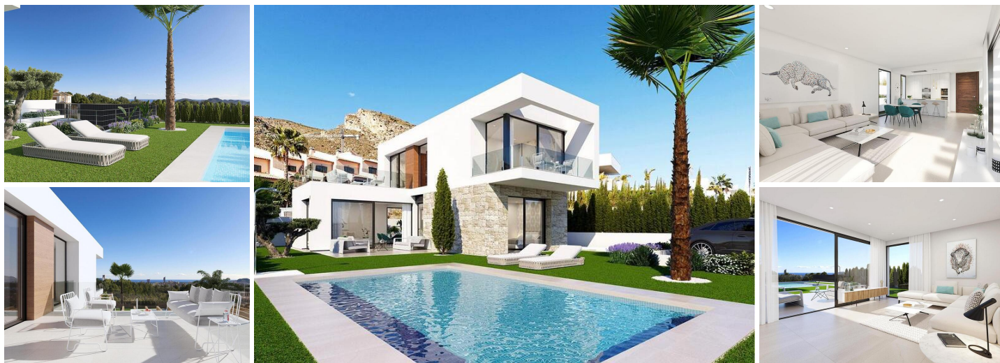
Luxurious New-Build Villas in Sierra Cortina, Finestrat

Explore the elegant new development of independent villas in the exclusive neighborhood of Sierra Cortina, Finestrat. Nestled in a picturesque area close to Benidorm, these premium properties offer modern living spaces and top-notch amenities. With easy access to the Mediterranean coast, these villas are ideal for anyone seeking a blend of luxury, comfort, and convenience. Just 5 km from the vibrant city center of Benidorm, this development also places you within a short distance of major points of interest.