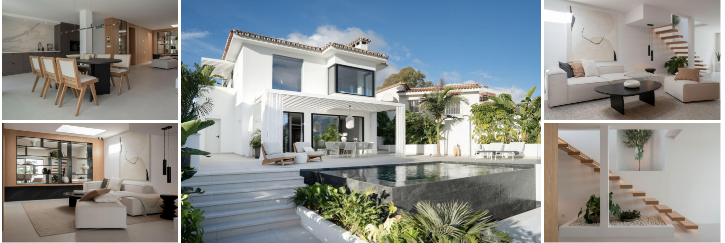
NUEVA ANDALUCIA ... 5 Bedroom, 5 Bathroom Villa

FREE Notary fees exclusively when you purchase a new property with MarBanus Estates