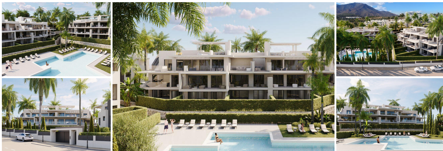
"Luxury Apartments for Sale in Estepona

Discover Sunway Residence Estepona: an exclusive new development featuring 48 apartments and penthouses with two and three bedrooms, located within walking distance of the beach and local amenities in the beautiful area of Arroyo Enmedio in Estepona on the Costa del Sol.