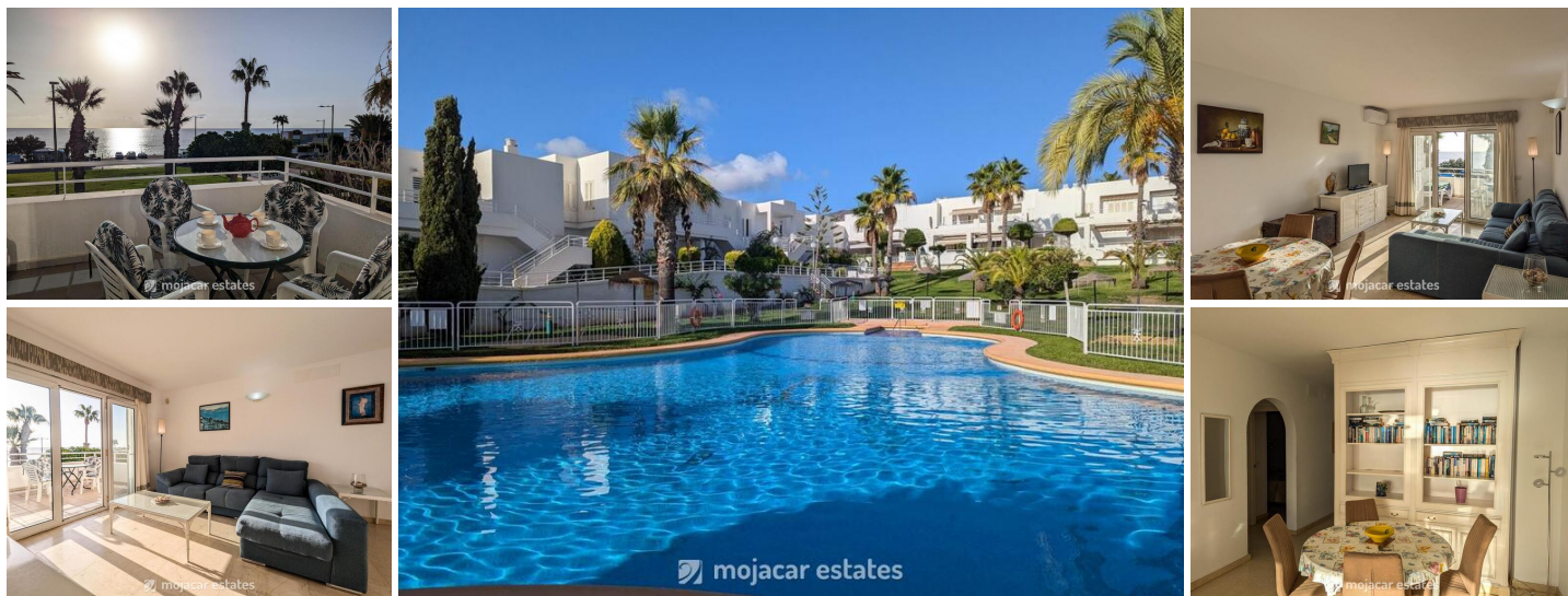
Parque Residencial Lom

Lovely top floor apartment for 4 people in sea frontline position in residential complex with swimming pool and garage space next to commercial centre in Mojácar Playa.