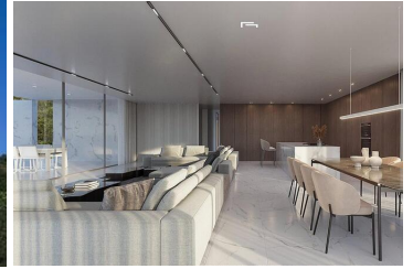
LUXURY NEW BUILD VILLA WITH THE SEA VIEWS IN MORAIRA

New Build Luxury villa with sea views in Moraira.